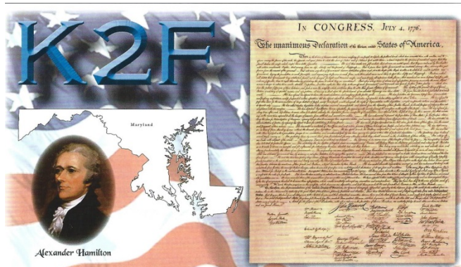
13 Colony Special Event 2015 - Maryland